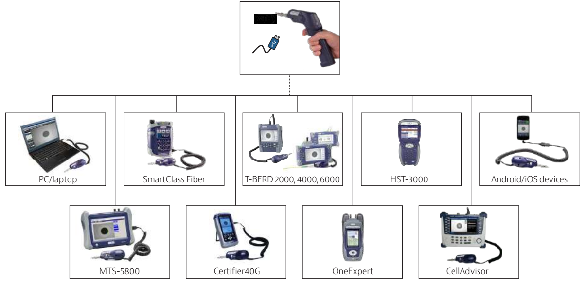
Connectable VIAVI devices include: SmartClass™ Fiber family, T-BERD®/MTS family, OneExpert™ (ONX) family, CellAdvisor®, Certifier40G™, and MP-60 optical power meter

As an all-in-one inspection solution, the FiberChek probe rarely needs to connect to other devices. However, many technicians already use other devices as part of their testing and do not want to disrupt their existing workflows. That's why FiberChek integrates with other VIAVI test devices to significantly improve productivity when you use them together. FiberChek can function independently of another test device, saving time by letting technicians test their next ports while an existing test is still in process.