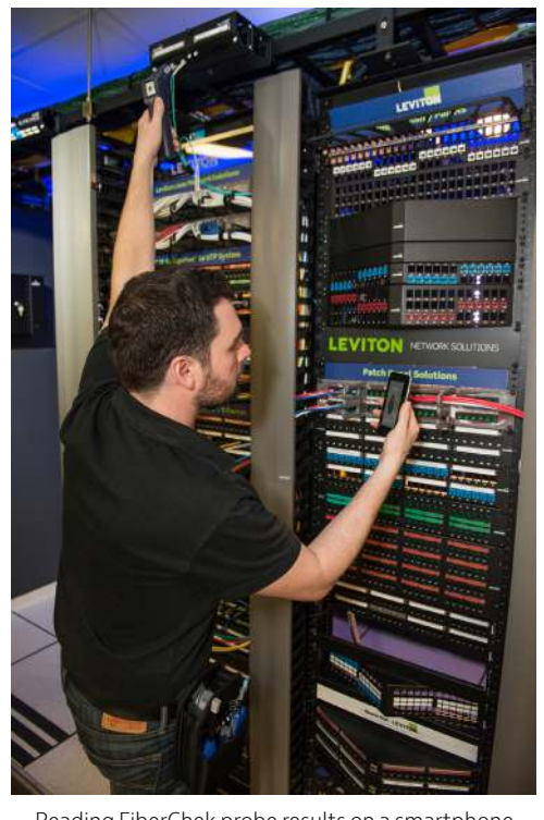
Reading FiberChek probe results on a smartphone